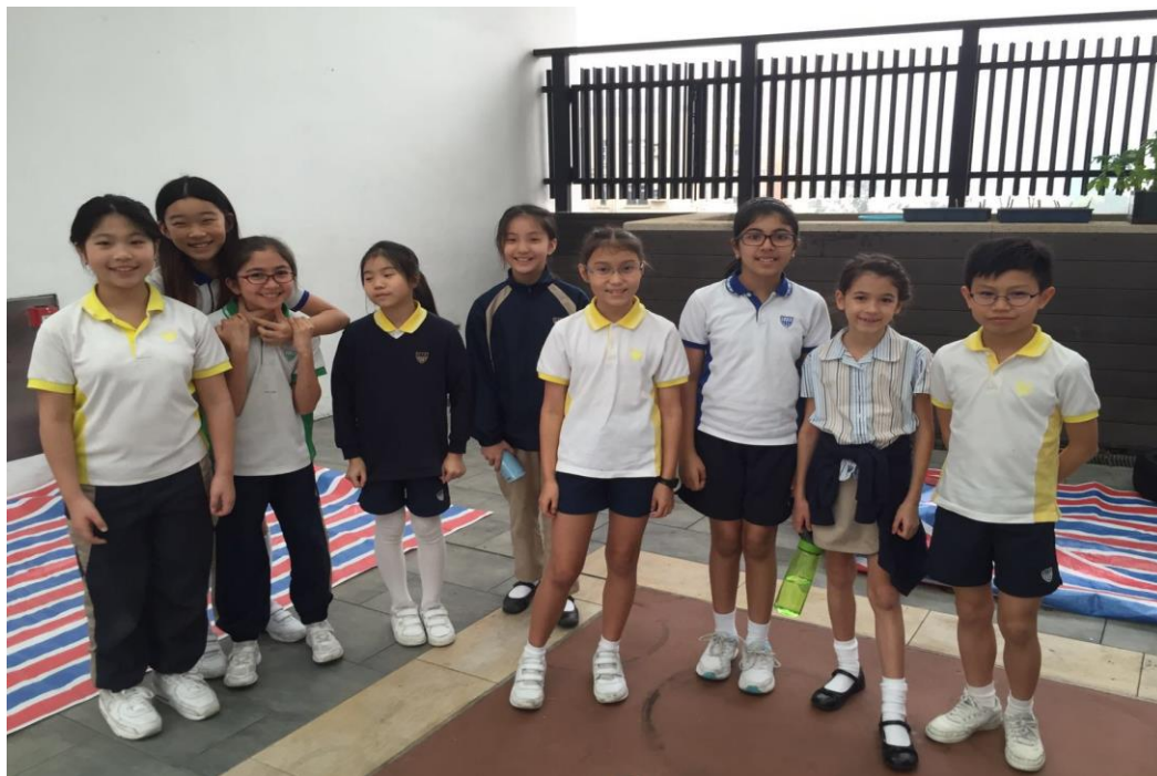
These students were part of the landscaping team that designed green spaces and features to improve our school.

We will use this platform to keep our school community updated on the journey KJS will take to becoming a more sustainable school. Click on the link below to see some of the features and initiatives that have been undertaken from the design and building of our school campus.