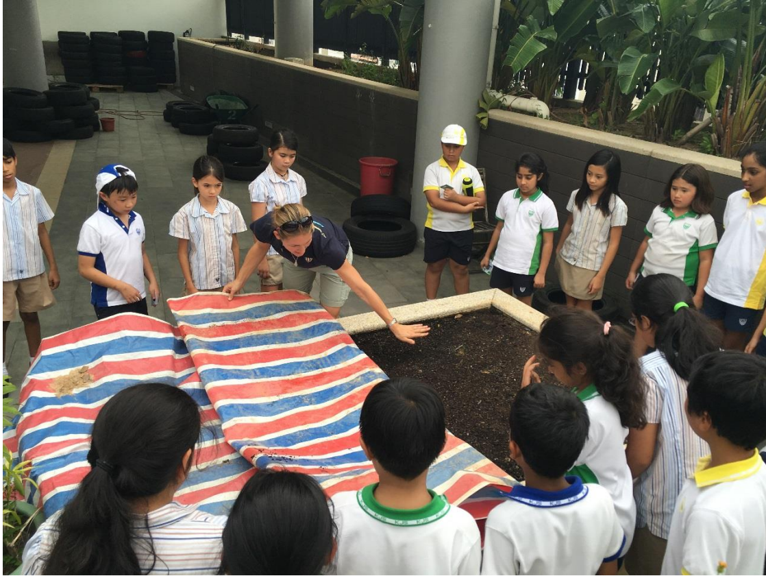
Preparing the soil beds ready for planting.