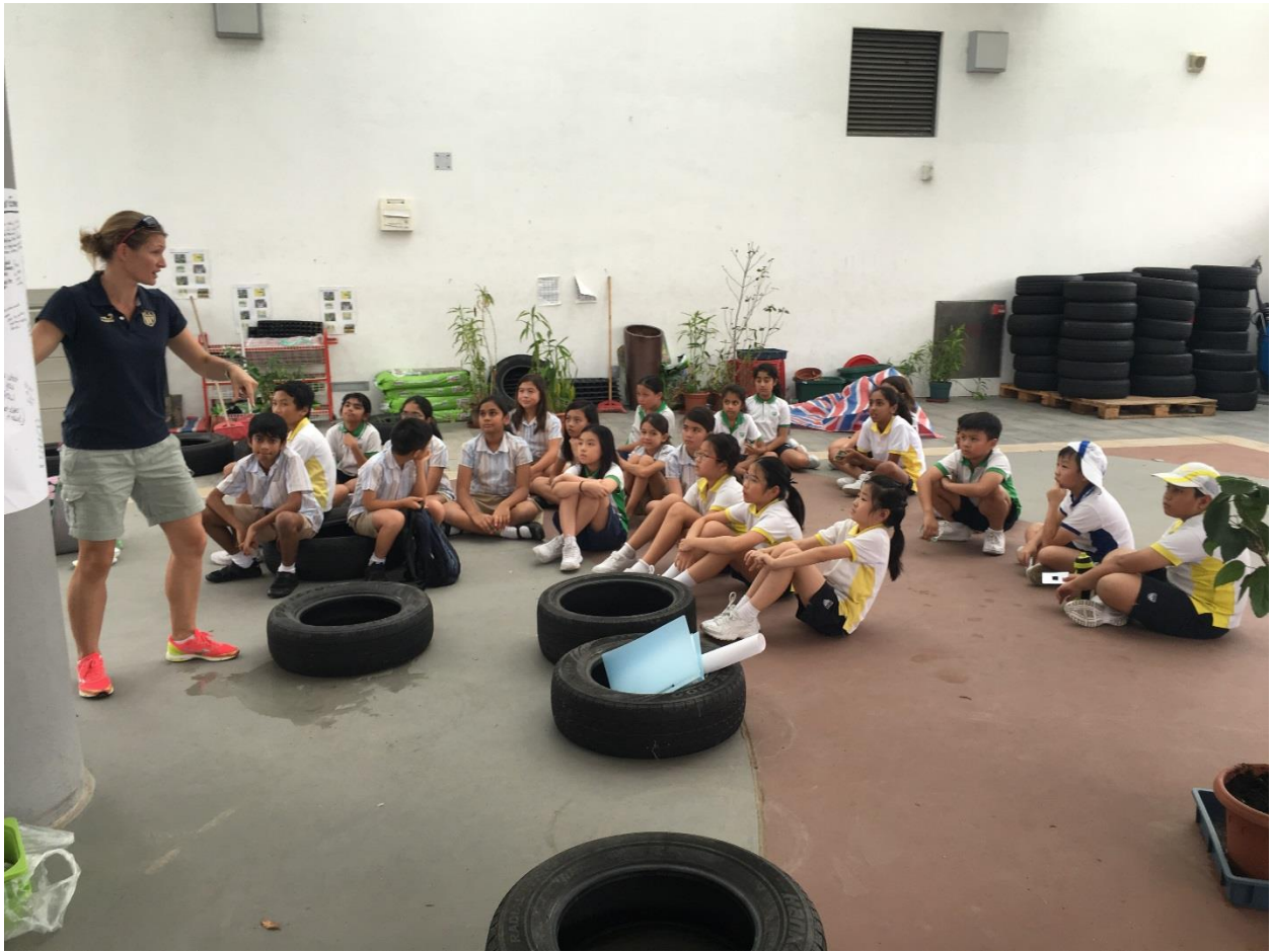
Year 5 and 6 students brainstorming about sustainable solutions to maintaining our garden areas.